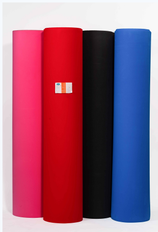
EVA Foam Rolls — Full Colour Range