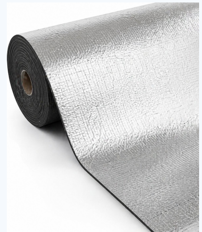
Aluminium Laminated EVA Foam Roll