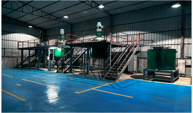
Chemical compounding and adhesive plant — interior