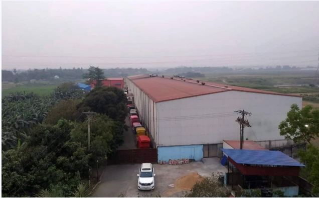
Manufacturing facility — Bhulta, Rupganj, Narayanganj

Three integrated manufacturing divisions — EVA foam production, insulation and construction materials, and industrial chemical compounds — each operated fully in-house at Bhulta, Rupganj, Narayanganj.